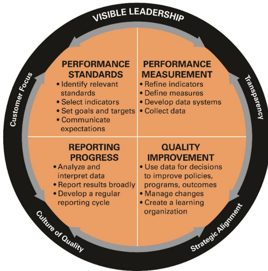
Figure 1: Turning Point Public Health Performance Management System (Public Health Foundation, 2015)